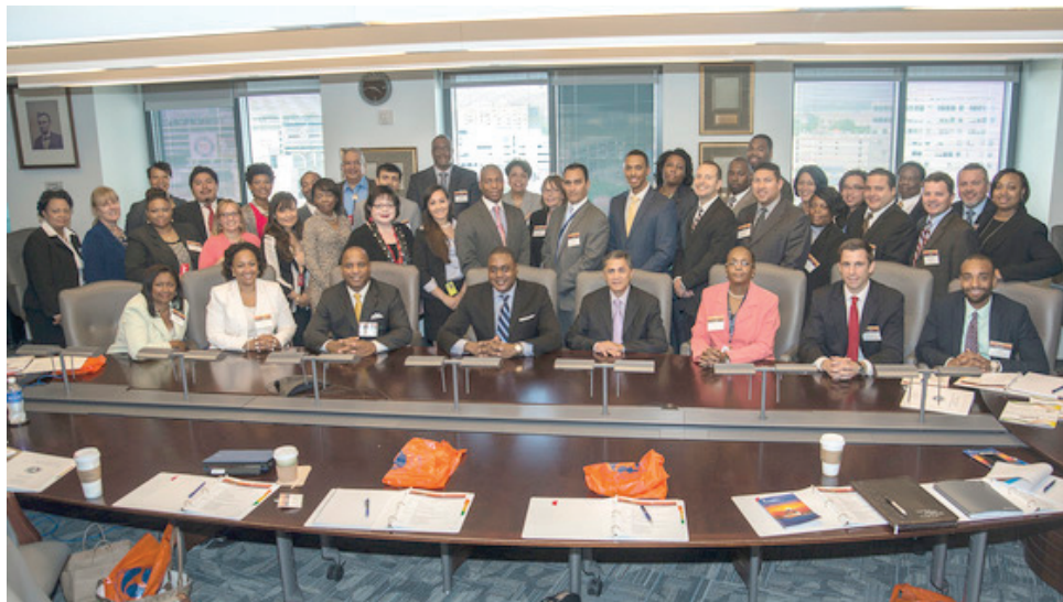
DOT's OSDBU team with Deputy Secretary Mendez

Seventh consecutive year DOT earned at least an "A" rating.